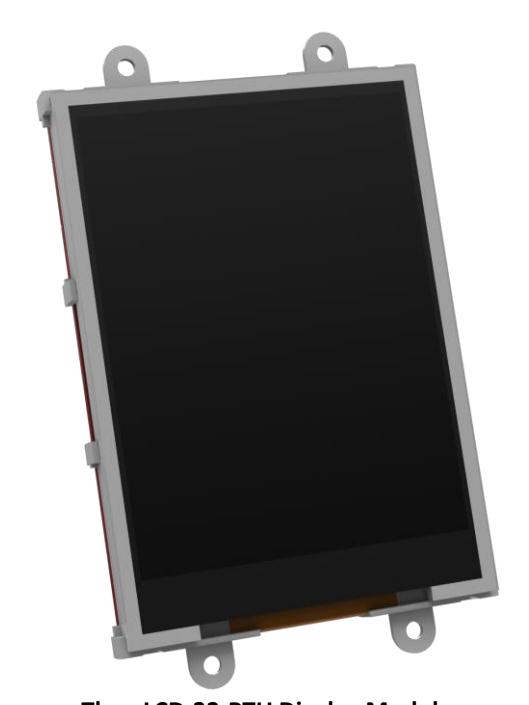
The uLCD-32-PTU Display Module